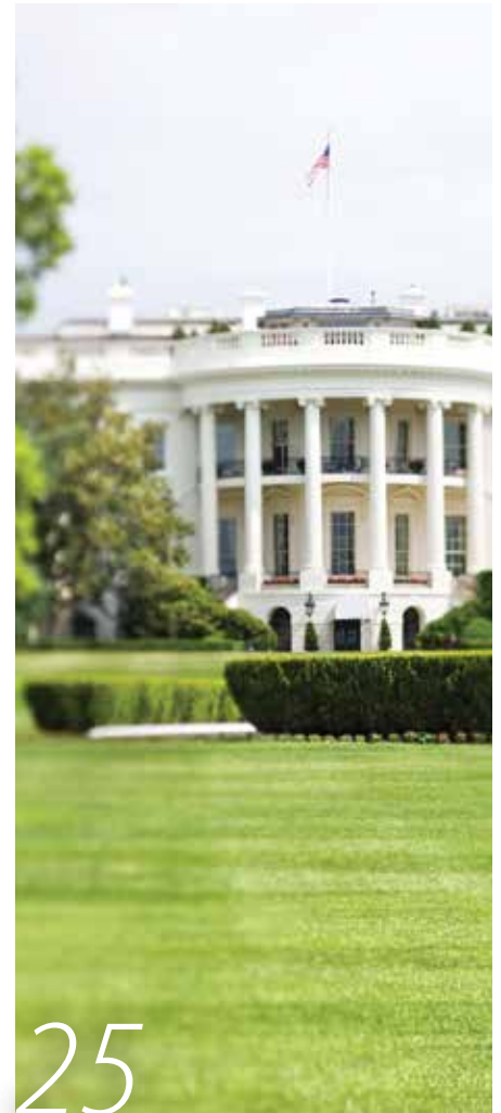
Public Policy Conference