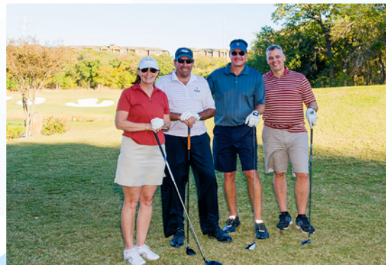
A “Friendraiser” at the OneShow (left) and a golf tournament at CTW harnessed new enthusiasm and support for the NAMA Foundation.