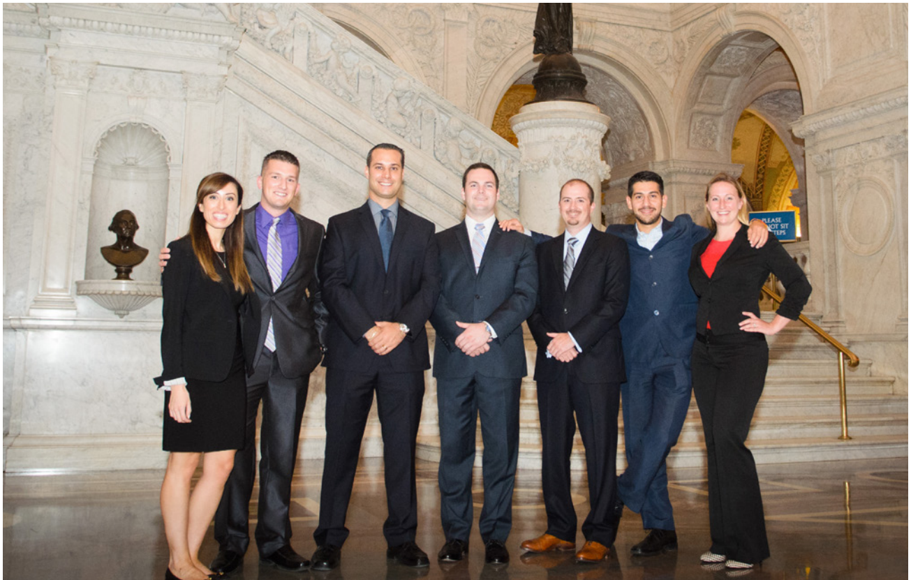
Top left: NAMA members and staff meet with USDA Undersecretary Kevin Concannon at the 2014 Public Policy Conference // Top right: New logos for FitPick and FitPick SELECT were unveiled in 2014 // Bottom: Members of NAMA's Emerging Leaders Network, who made up 10% of participants at the Public Policy Conference, pose for a photo at the Library of Congress